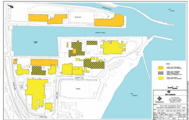
Figure 2: (Planned VIM Activities)

VIM has completed demolition of the Centre Pier buildings, removal of equipment from surplus buildings and begun transfer of accumulated waste to the LTMWF. The project is expected to continue until at least 2027. Figure 2 illustrates the buildings that will be removed or partially decommissioned as part of Stage I. The total volume of material to be removed as part of VIM will be determined as detailed engineering for each stage is completed, will remain within the Cameco allocation of approximately 150,000 m3 in the Port Hope LTMWF.