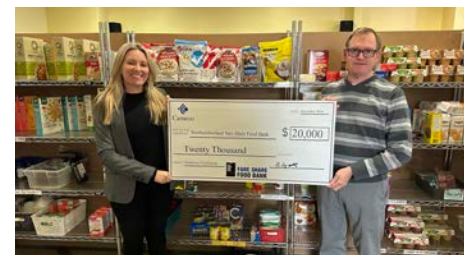
PHCF employees raised $20,000 to support Northumberland Fare Share Food Bank.

We are proud to share with you the impact of our corporate investments and employees' collective efforts across Northumberland County in 2024: