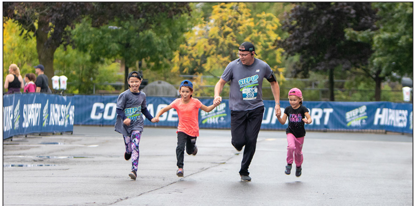
Registration is open now for the virtual Step Up for Mental Health which takes place October 1 - 6, 2021.

Registration for the Cameco Charity Golf Package is open now, and participants can pick a day