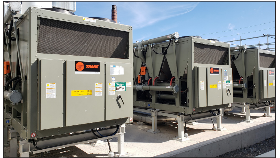
Components of the new closed loop cooling system at the Port Hope Conversion Facility. Lake water is no longer used to cool production process at the facility.

The system now services both the UF 6 and UO 2 plants, as well as other sub-systems at PHCF.