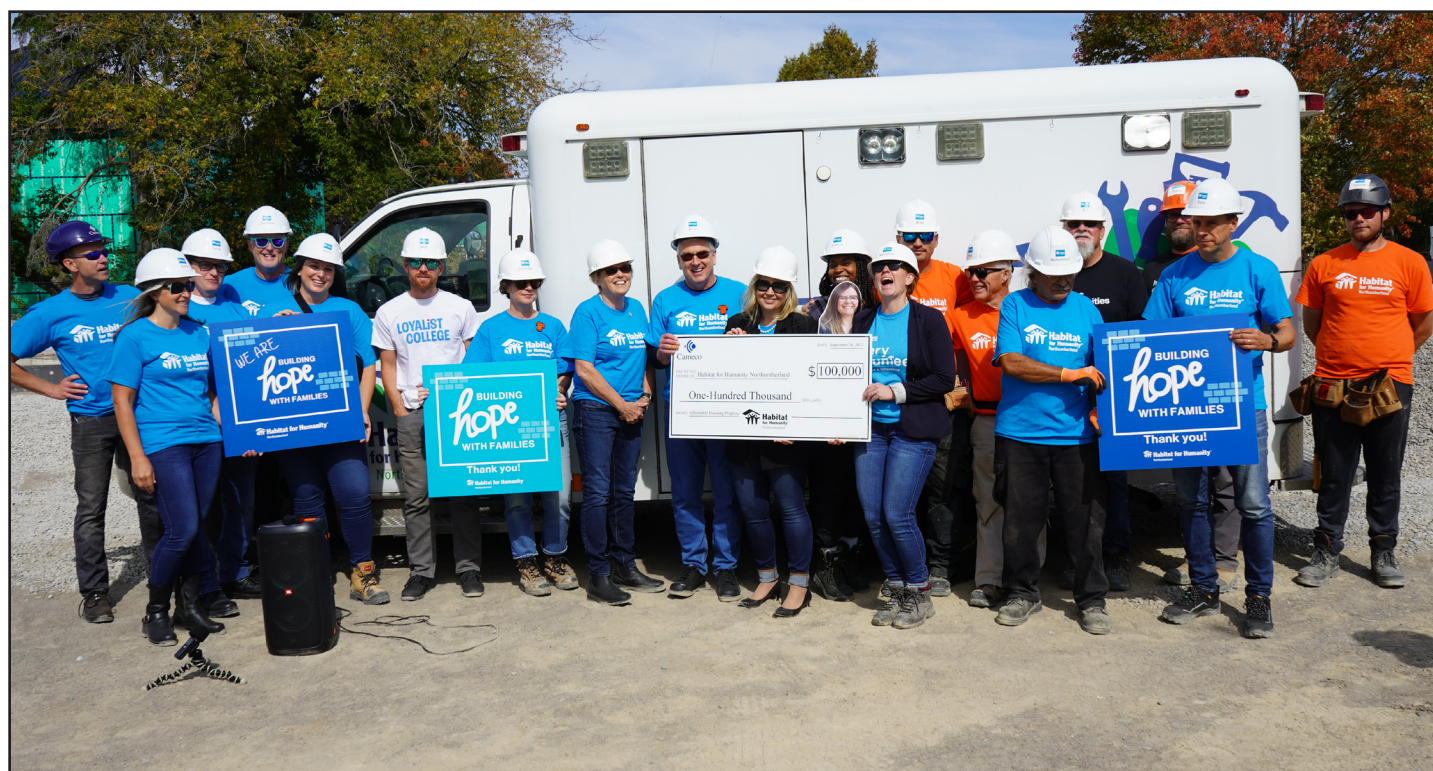
Members of the Cameco leadership team presented Habitat for Humanity Northumberland with a $100,000 gift on September 28.