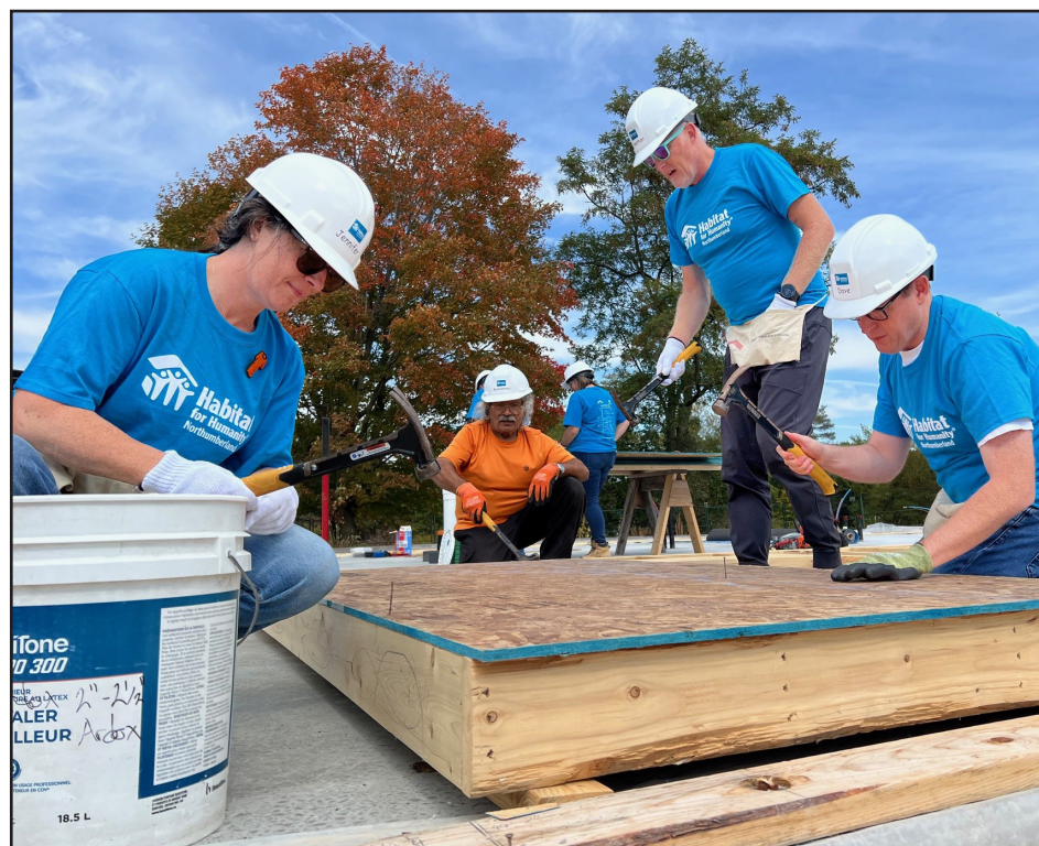
Cameco employees participated in the build process at the Habitat for Humanity build site in Baltimore after the cheque presentation on September 28.

Cameco was established on October 5, 1988, and celebrates its 35th anniversary this year. As proud and active members of the local community, Cameco supports a wide variety of local organizations and community projects every year.