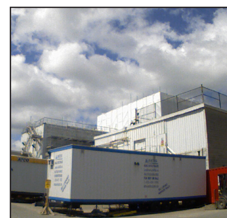
Left: Building 27 in October 2022. Right: Building 27 as of September 2023.